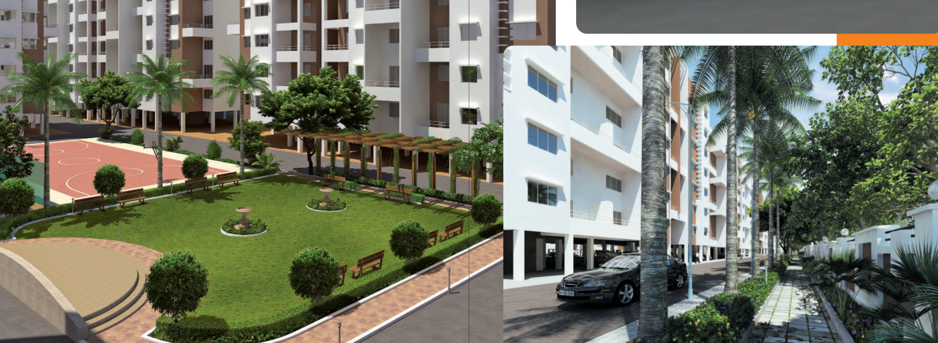
Cluster 3 showing Party Lawn, Stage and Wooden Trellis